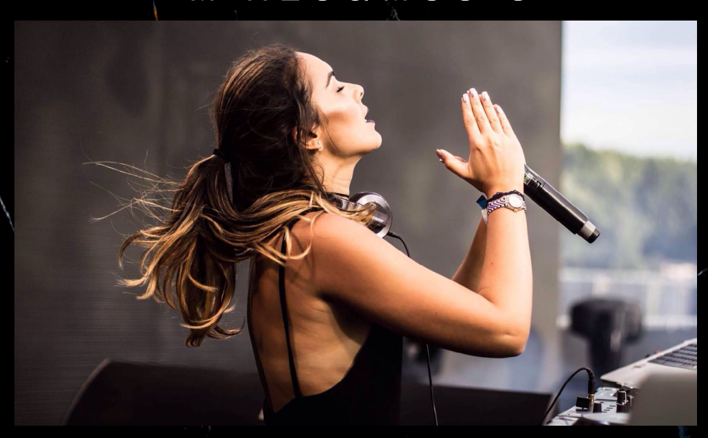
21 Savage - No Heart (Lady S Remix)